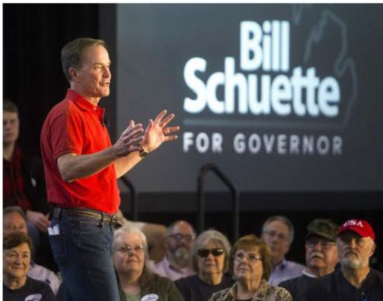
Michigan Attorney General Bill Schuette of Midland announces his gubernatorial campaign Tuesday, Sept. 12, 2017, at the Midland County Fairgrounds in Midland.

Schuette's two predecessors — Republican Attorney General Mike Cox and Democratic Attorney General Jennifer Granholm — did not have these positions, though Cox had a director of constituent relations near the end of his eight years in office, state records show.