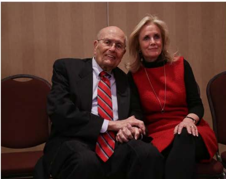
2014 FILE PHOTO -- U.S. Rep. John Dingell and his wife, Debbie Dingell, pose for a photo following a luncheon where Dingell addressed his retirement as the longest-serving member of Congress Southgate on Feb. 24, 2014.

When John Dingell Jr. retired in 2015, his wife, Debbie Dingell, ran for and won the 12th Congressional District seat she still holds.