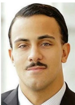
State Sen. Ian Conyers, D-Detroit.

"That is an extremely prominent phenomenon if you look in Michigan, especially after term limits," Sarbaugh-Thompson said. The effort to curtail decades-long political dynasties essentially backfired in that way, as relatives of elected officials have ridden into office on the coattails of relatives forced out by term limits.