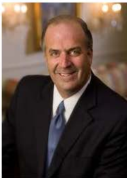
Dan Kildee is the U.S. Rep. for Michigan's Fifth Congressional District.

It worked for U.S. Rep. Dan Kildee, too. The Flint Democrat was elected to Congress in 2012, filling the spot his uncle Dale Kildee held for more than three decades.